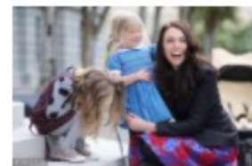
The 2017 world in review – elections and transfers of power