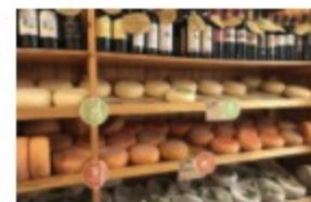
US cheese-producing states benefit from China's tariff cut