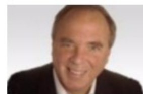
Times Square stunt drives home a bittersweet reality