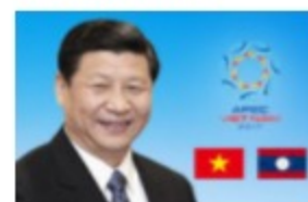
President Xi attends APEC meeting