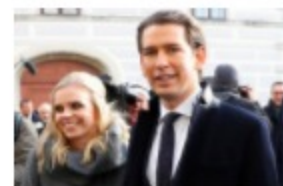
New Austrian coalition gov't sworn in amid protests