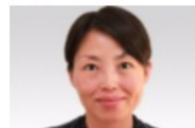
New platforms build medical bridges