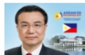
Premier Li attends ASEAN meetings, East Asia Summit