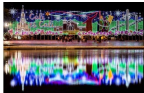
The world in photos: Dec 11 - 17